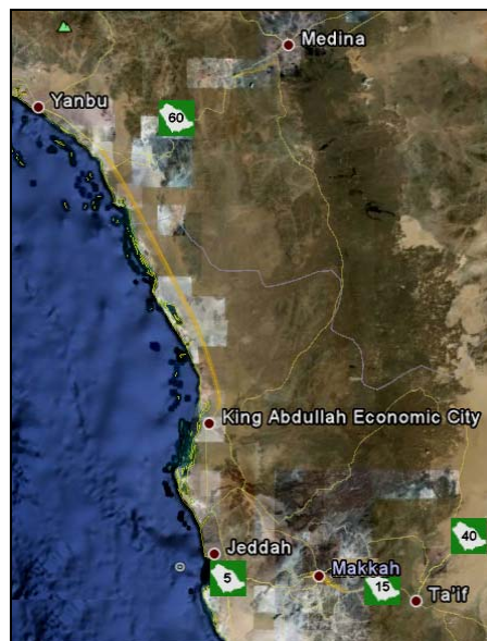
The main cities within the geographic zone of the project