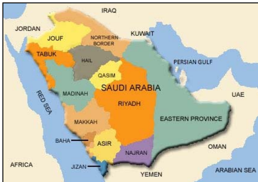
Administrative areas/provinces in KSA